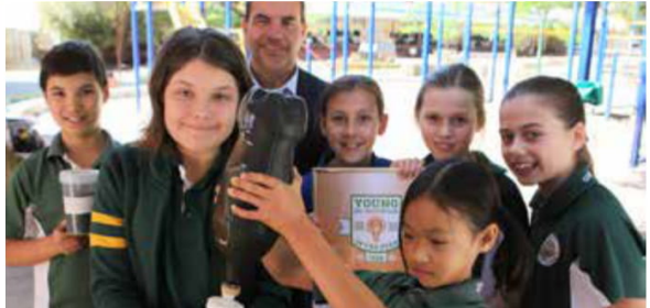
2019 Winner COOLBINIA PRIMARY SCHOOL Time to Take Action; Every Drop, Every Tonne Helps

Experienced judges from education business and industry will assess student work.