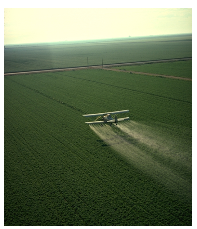
Technologies during the Green Revolution greatly increased global food production.

I changed my mind and ceased being a greenie. I was excited when the Labor party won the 1972 election. The Whitlam government introduced major social changes. But it was weak on economic and financial matters, which were allowed to descend into chaos. My own salary was at risk. I changed my political mind and ceased to be a member of the Labor Party.