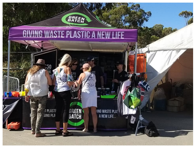
Greenbatch's Event Trailer educating people about plastic identification, purchasing and disposal.

At the drop off days Greenbatch volunteers would have the chance to learn how to sort plastic and also