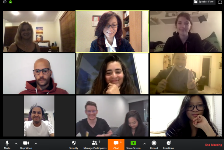
Photos (L to R): Greenbatch solving plastic waste problems in WA; SDG Forum Organising Committee members adjusting to the new normal