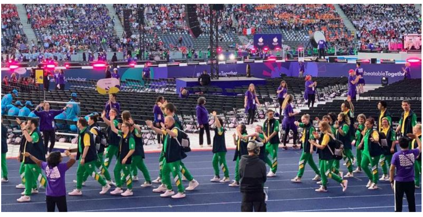
Australian delegation of athletes at the opening ceremony

NATIONAL AND INTERNATIONAL SPORT FEDERATION REPRESENTATIVES