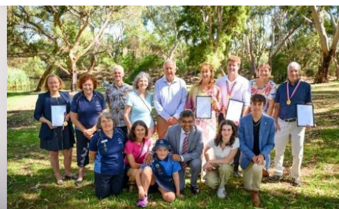
City of Melville's Community Citizen of the Year Awards Recipients