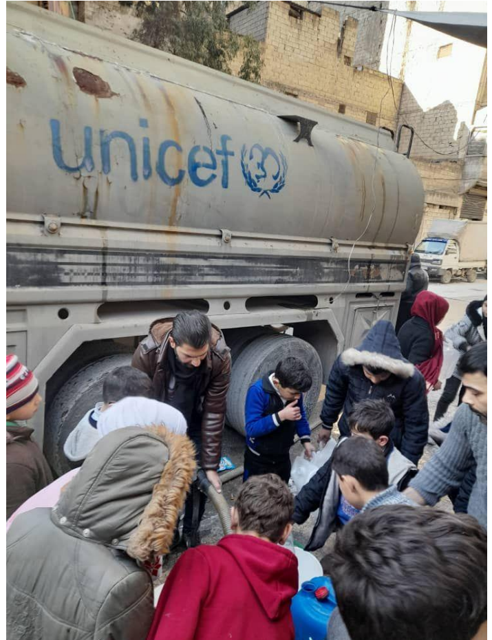
Water supplies arrive at Aleppo, Syria